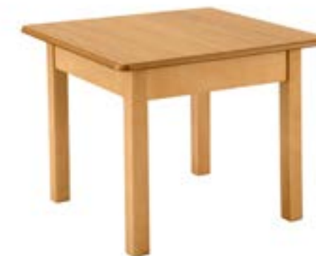
CTU Low Square Coffee Table