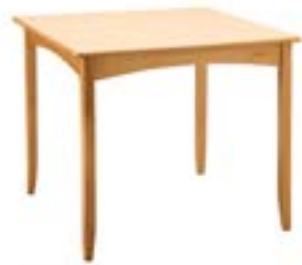
DTS Square Dining Table