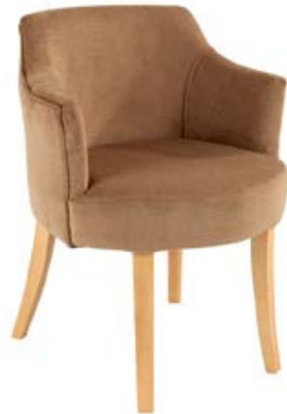
Shrewsbury Tub Chair SHRT

Shrewsbury chairs have been cleverly created to look good in any location.