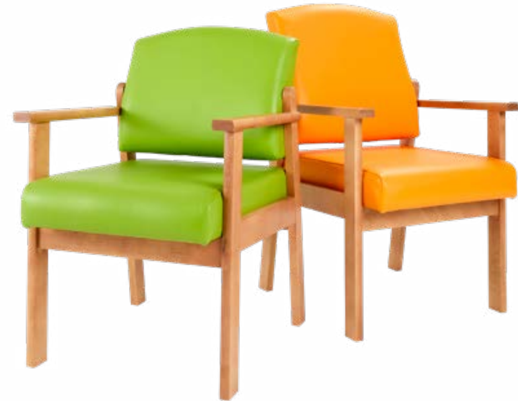
BL105 Balero Low Back Chair RS Removable Seat Cushion