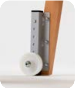
Height Adjusters With Rear Wheels JW