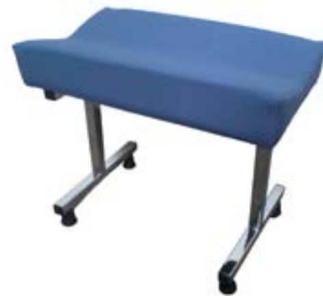
FAJ Height Adjustable Footstool