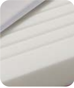
Removable Pressure Relief Low/Med Risk Comfort Cushion: VRS Removable Pressure Relief High Risk Pressure Relief Cushion: VRSX

To make an enquiry or to purchase this product call 01606 593456 or email sales@renrayhealthcare.com