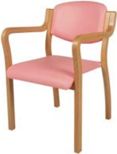
Finland Stacking Chair w/ Arms F835