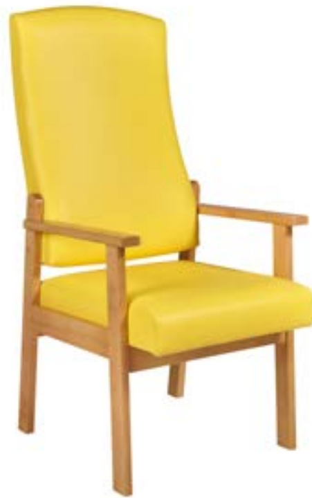
BL300 Balero High Back Chair RS Removable Seat Cushion

Attractive and practical design with a robust frame