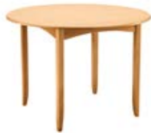
DTC Circular Dining Table

A variety of stylish shapes and designs to cover all dining requirements, in a smooth, heat resistant laminate finish.