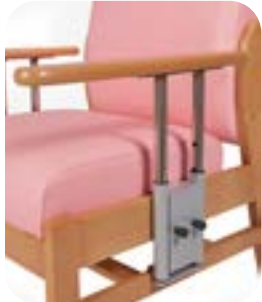
Drop Down Arms DDA