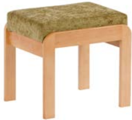
FRO Royal Footstool

Designed to complement the Renray patient seating range