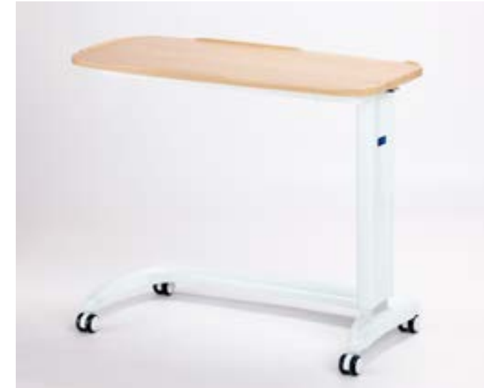
Enterprise non-tilting overbed table/ chair with plastic base cover PT10KAMBC-Beech