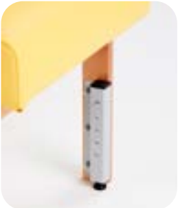
Height Adjusters J