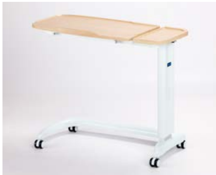
Enterprise tilting overbed table/chair with plastic base cover PT11KAMBC-Beech

The Enterprise™ tables are lightweight, durable and easy to clean. For complete flexibility they have been designed for the patient to use both in bed and when seated in a chair.