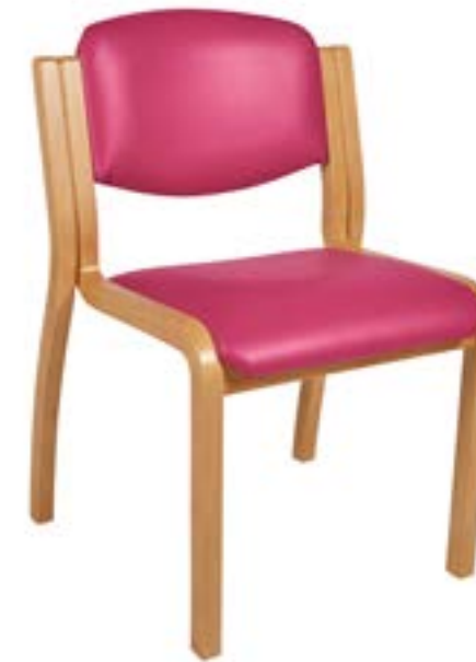
F833 Finland Stacking Chair

A modern style available in a choice of contemporary colours.