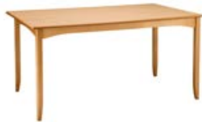
DTR Rectangular Dining Table