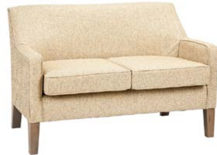
Kingsley 2 Seater Sofa KINL2S

Affordable, contemporary & comfortable compact seating suitable for any living space.