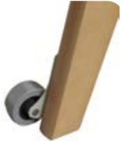
House Keeping Wheels H