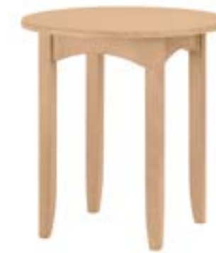
CTC Circular Coffee Table

Versatile and stylish, available in an attractive smooth laminate finish.